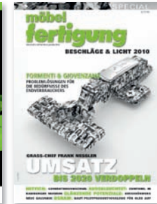
Hardware and fittings Special