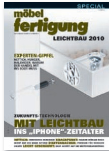
Lightweight material Special